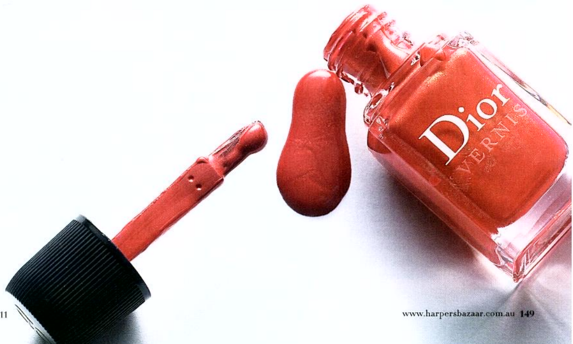
Dior Vernis Haute Couleur Extreme Wear Nail Lacquer in Red Royalty, $39, (02) 9695 4800.

From counter classics to plucky cult brands, miracle creams to the runway's new makeup hues, BAZAAR presents the definitive top-to-toe beauty product edit