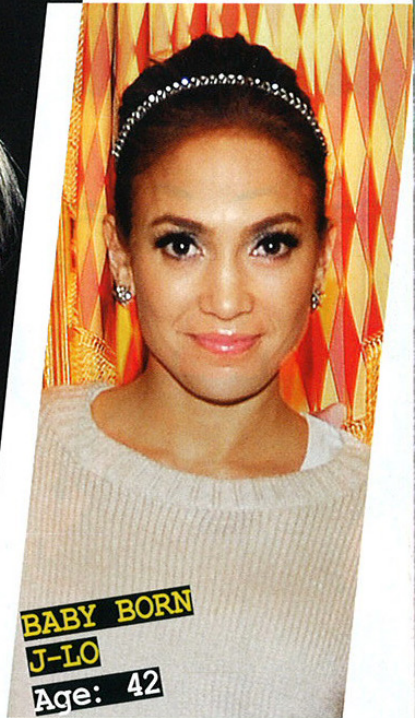
BABY BORN J-LO Age: 42