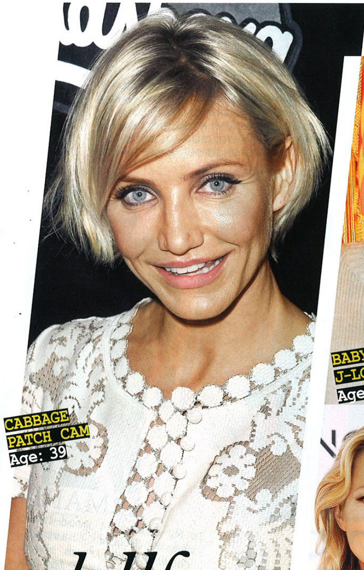
CABBAGE PATCH CAM Age: 39

As for Mossy, 38, you wouldn't expect her to have such glowing skin after years of smoking and binge drinking, yet it only seems to get